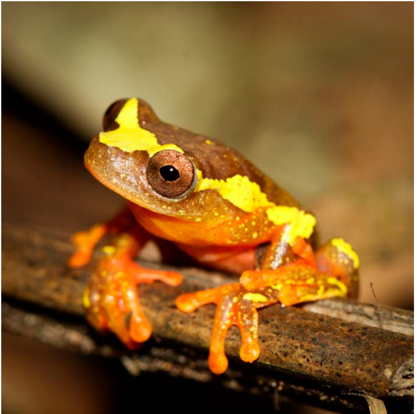
Figure 1. Dendropsophus sarayacuensis (ZUFMS-AMP15377) from Estação Ecológica Rio Acre, municipality of Assis Brasil, AC, Brazil.